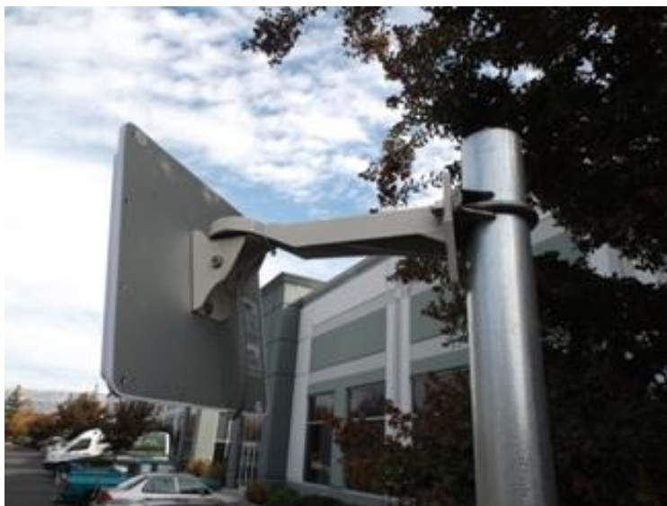
Figure 3. LR-MB with LR-3000 reader, clamped to round pole.