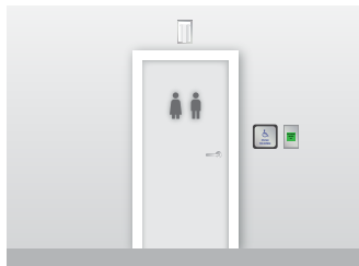
Single Occupancy Restroom