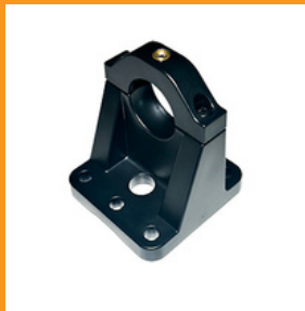
Ball & Socket Mounting Bracket