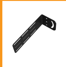
Optional: HRD-288-1 Universal Mounting Bracket