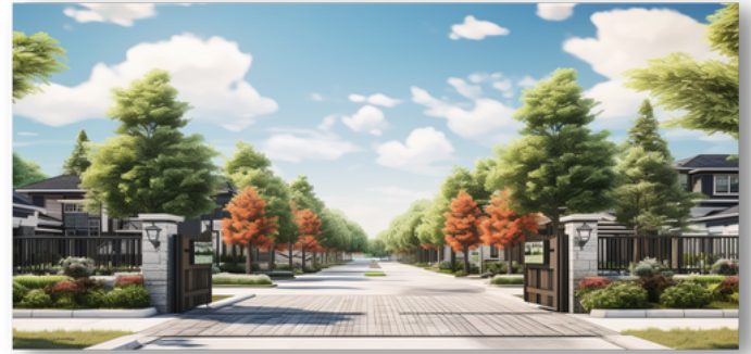
Residential and Commercial Solutions

Our RFID Patriot Series products feature a broad operating frequency, robust/weather-resistant housings, and high compatibility with various communication protocols. Exceptional read ranges cater to various scenarios, while large user storage and real-time processing provide you with the control and adaptability you need. Each product in the Patriot Series is designed with user experience in mind , offering features like LED indicators, relay driver output, and software-adjustable parameters to cater to your unique requirements.