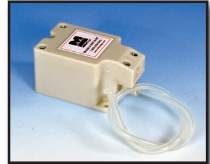
AW14-RF : AW-10 Switch complete with a transmitter in a Molded Enclosure