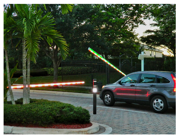
A Division of BlackSky Technologies, Inc.