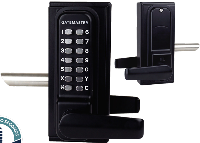
BDGSRR right hand version shown