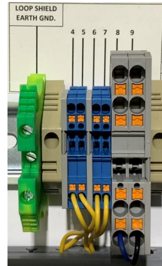
Right-Side Terminal Blocks Accepts 14-24 AWG Wire

*The +24V is only present while one of the vehicle detectors is currently detecting a vehicle