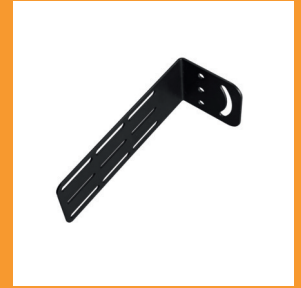
Optional: HRD-288-1 Universal Mounting Bracket