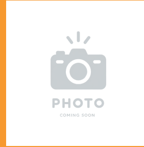
Optional: EMX-1916-1 IRB-MON2-4X2-HD-GLD