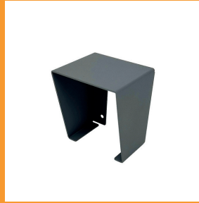
Optional: EMX-1915-1 IRB-MON2-4X2-HD-GRY