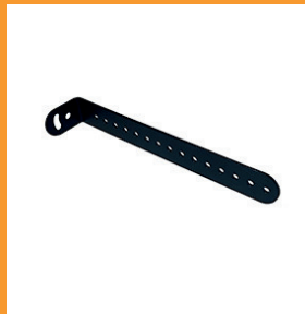
Reflector Extension Bracket