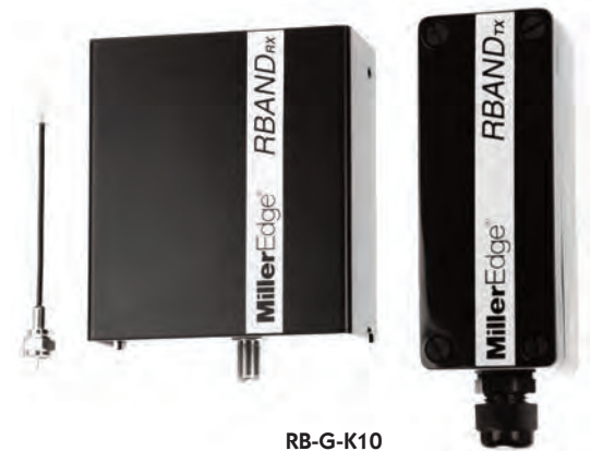
RB-G-K10 Receiver (RB-G-RX10) & Transmitter (RB-TX10)

The Miller Edge RBand eliminates the need to hard wire sensing edges and meets 2016 UL 325 standards for commercial gate operators.