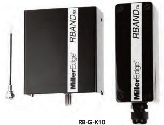
RB-G-K10 Receiver (RB-G-RX10) & Transmitter (RB-TX10)

The Miller Edge RBand eliminates the need to hard wire sensing edges and meets 2016 UL 325 standards for commercial gate operators.