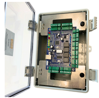
BOARD + HOUSING